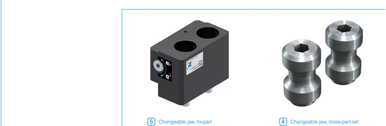
5 Changeable jaw, fix-part