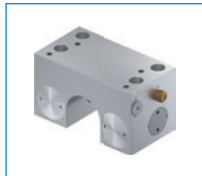
Series MKR Clamping element