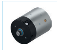
Series RBPS Clamping and braking element