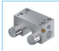
Series MKRS Clamping element