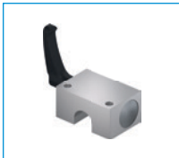
Series HKR Clamping element