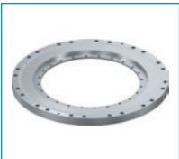
Series DKHS1000 Clamping element