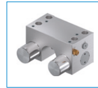
Series MKRS Clamping element