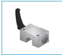
Series HKR Clamping element