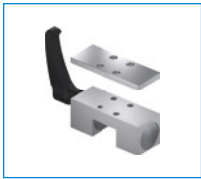
Series HK Clamping element