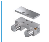
Series MKS Clamping element