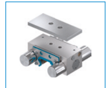
Series MBPS Clamping and braking element