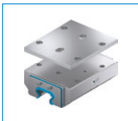
Series KWH Clamping element