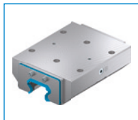
Series KBH Clamping and braking element