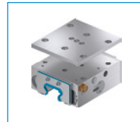
Series UBPS Clamping and braking element