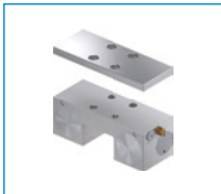
Series MK Clamping element